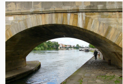
Stone Bridge detail