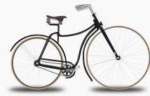
Vintage Fahrrad.png 1,280 × 901; 380 KB