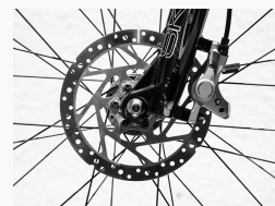
Scheibenbremse.jpg 640 × 480; 92 KB