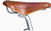
Fahrradsattel.png 640 × 413; 160 KB