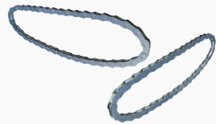
Fahrradkette.png 640 × 360; 133 KB