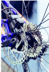
bike-brake.jpg 853 × 1,280; 244 KB

The following 4 files are in this category, out of 4 total.