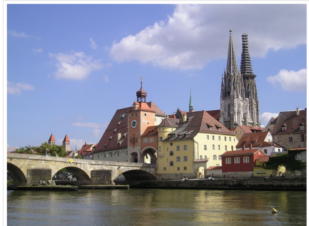
View of Regensburg

Regensburg became the cultural centre of southern Germany and was celebrated for its gold work and fabrics.