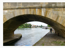
Stone Bridge detail