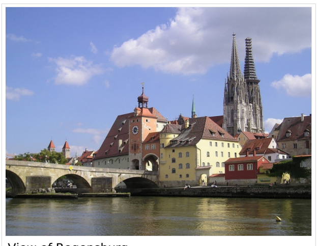
View of Regensburg

Throughout the centures, the city was known by a variety of names. It is still known in the