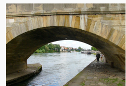
Stone Bridge detail