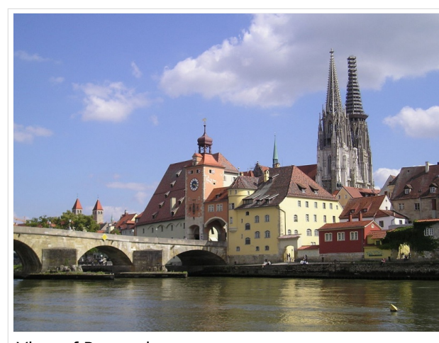
View of Regensburg

Throughout the centures, the city was known by a variety of names. It is still known in the