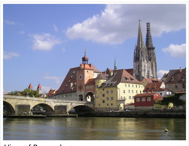
View of Regensburg

Throughout the centures, the city was known by a variety of names. It is still known in the