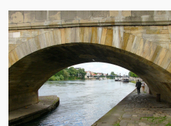
Stone Bridge detail